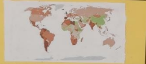
GDP GROWTH RATES IN THE WORLD

The economic impact of the COVID-19 pandemic in India has been largely disruptive. India's growth in the 4th quarter of the fiscal year 2020-21 went down to 3.1% according to nominal unemployment rose from 6.7% to 26%. Up to 53% of businesses in the country were projected to be significantly affected. India's exports fell by -36.65% year-on-year. Imports fell by -47.36% as compared to April 2019 on 23 March 2020. Stock markets in India post worst losses in history. SENSEX fell 4000 points (13.15%). The centre for sustainable agriculture found that 10% of farmers could not harvest their crop in the past month and 60% of those who did harvest reported a yield loss. Companies like ultra tech cement, Tata motors, diddy birla group momentarily suspended or significantly reduced operation in a number of manufacturing facilities & factories across the world on April 2020. India changed its foreign direct investment policy to curb opportunistic takeovers of Indian companies.